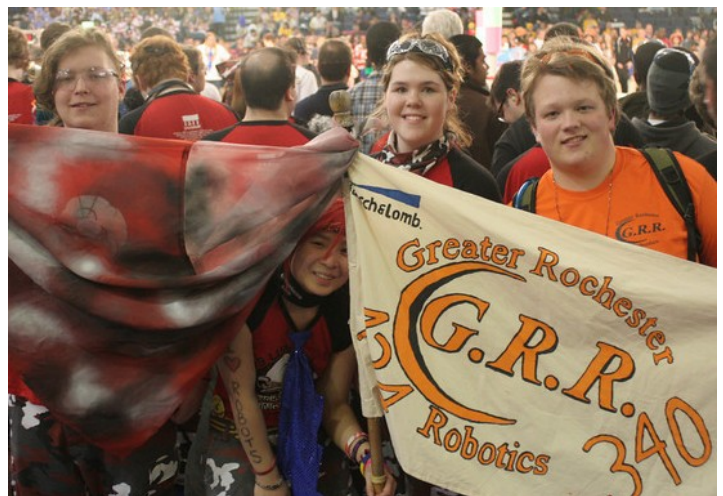
Alliance-mates from Team 1511 and Team 340 at the Finger Lakes Regional competition.

“Fifty-five teams from as far away as the United Kingdom gathered at the Naval Academy in Annapolis.”