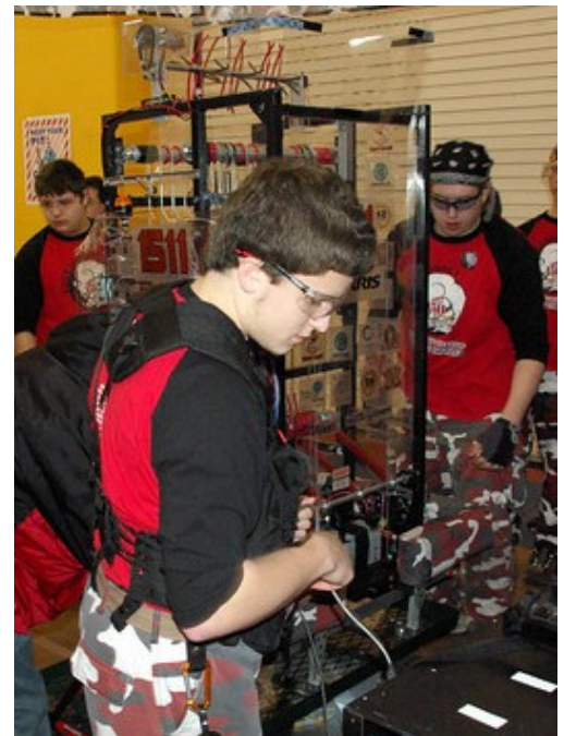
“Thunderplucker” getting some mechanical work in the pits at the Finger Lakes Regional.

We were delighted when Team 340 (Great Rochester Robotics from Churchville-Chili) asked us to join their 7th-seeded alliance! Team 316 (LuNaTeCs from South Jersey) rounded out our alliance, and what an alliance it was. We fought all the way to the finals with great strategy and teamwork. This is the best finish that Team 1511