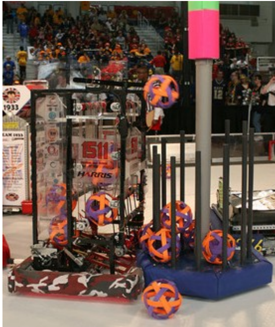
“Thunderplucker” scores by unloading “moon rocks” into an opponent’s trailer!

Qualifying rounds continued on Saturday, and Team 1511 ended up seeded 11th out of 55 teams. We were selected as a partner by the 8th-seeded alliance. After two very hard-fought quarterfinal rounds, our alliance was eliminated from the competition—but Team 1511 wasn’t ready to pack up! Again the team received