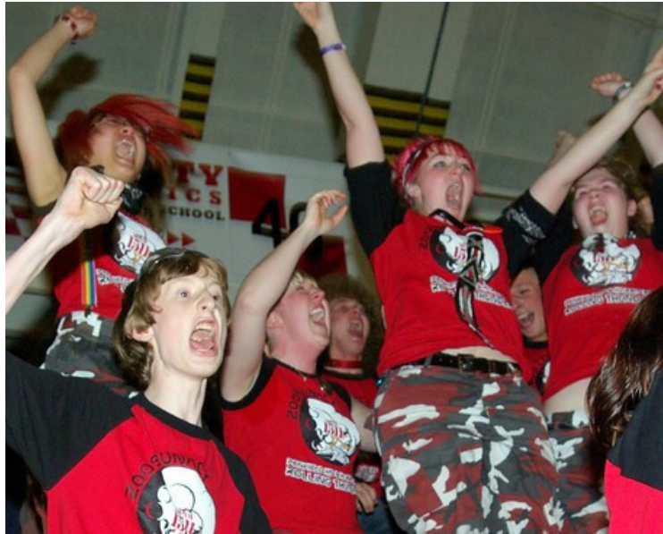
Team 1511 members celebrate at the announcement of the Chesapeake Regional Chairman's Award.

In a couple of short weeks, we'll be packing up to head for Atlanta, where over 300 teams from all over the world will meet in the Georgia Dome for three days of competition, presentations, and fun events. Team 1511 will be holding an "All Rookie Meet and Greet" for the rookie teams at the