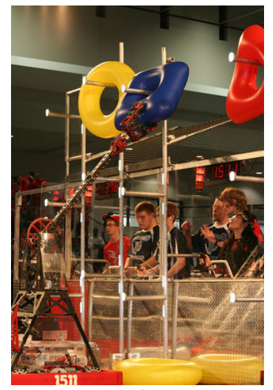
FIRST Team 1511's robot Thunderous Prime putting up a square tube

Harris-sponsored FIRST Team 1511 recently traveled to Washington, DC to compete in the FIRST Robotics Competition Regional, which took place March 24-26. It was their first time competing in DC, where this year's brand new drive team ranked 16 out of 63 teams. They were chosen to join the 4<sup>th</sup> seed alliance and made it to the semi-finals, but were beat out by the alliance that won the regional competition.