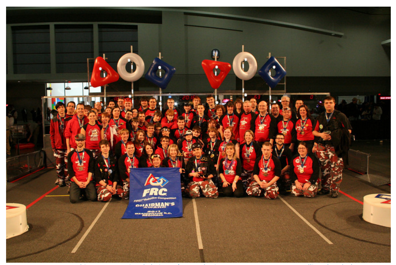
2011 Washington DC Regional Chairman's Award Winners, FIRST Team 1511 - Rolling Thunder!

For more information on Harris sponsored FIRST Team 1511 please visit: www.penfieldrobotics.com.